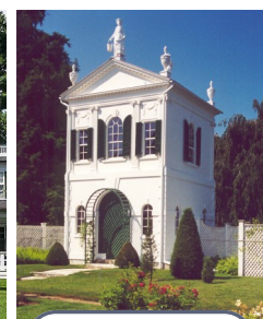
DERBY SUMMER HOUSE