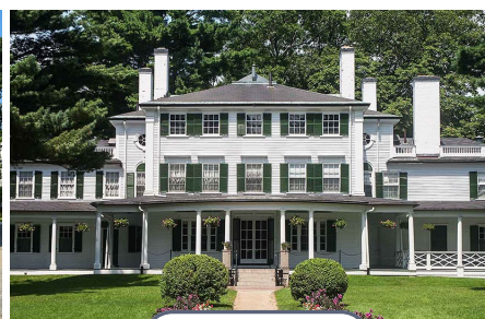
GLEN MAGNA FARMS