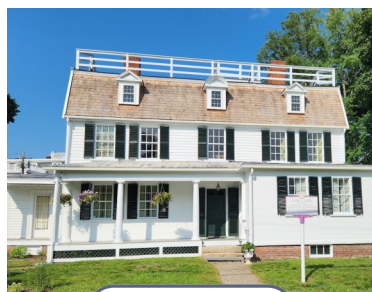
JEREMIAH PAGE HOUSE