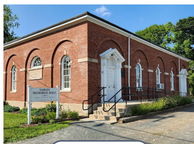
TAPLEY MEMORIAL HALL